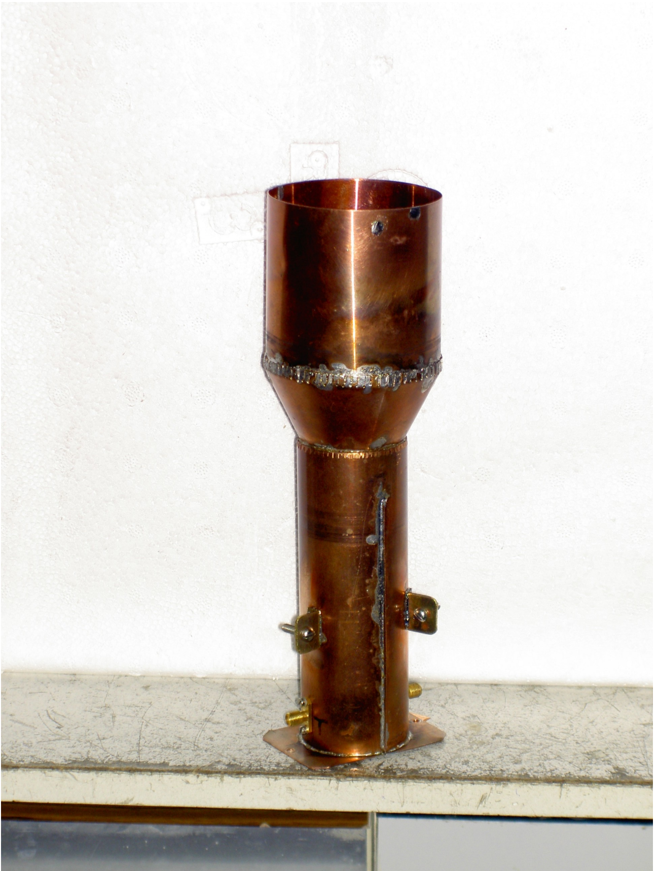
The Completed 6cm Dual Mode Horn